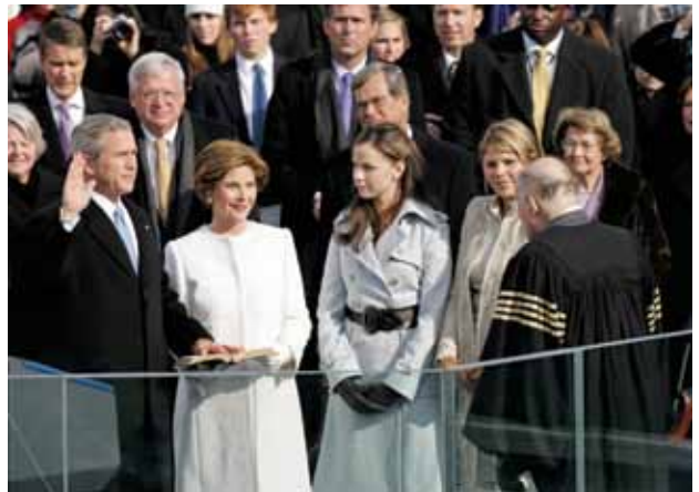
Inaugural Swearing-In Ceremony, Washington, D.C., January 20, 2005

The museum will take visitors on an exciting tour behind the scenes of the critical decisions of the Bush presidency. Through an interactive tour, hear directly from President Bush on what factors influenced critical policies, such as the President's Emergency Plan for AIDS Relief (PEPFAR), and how he led our nation through the attacks of 9/11.