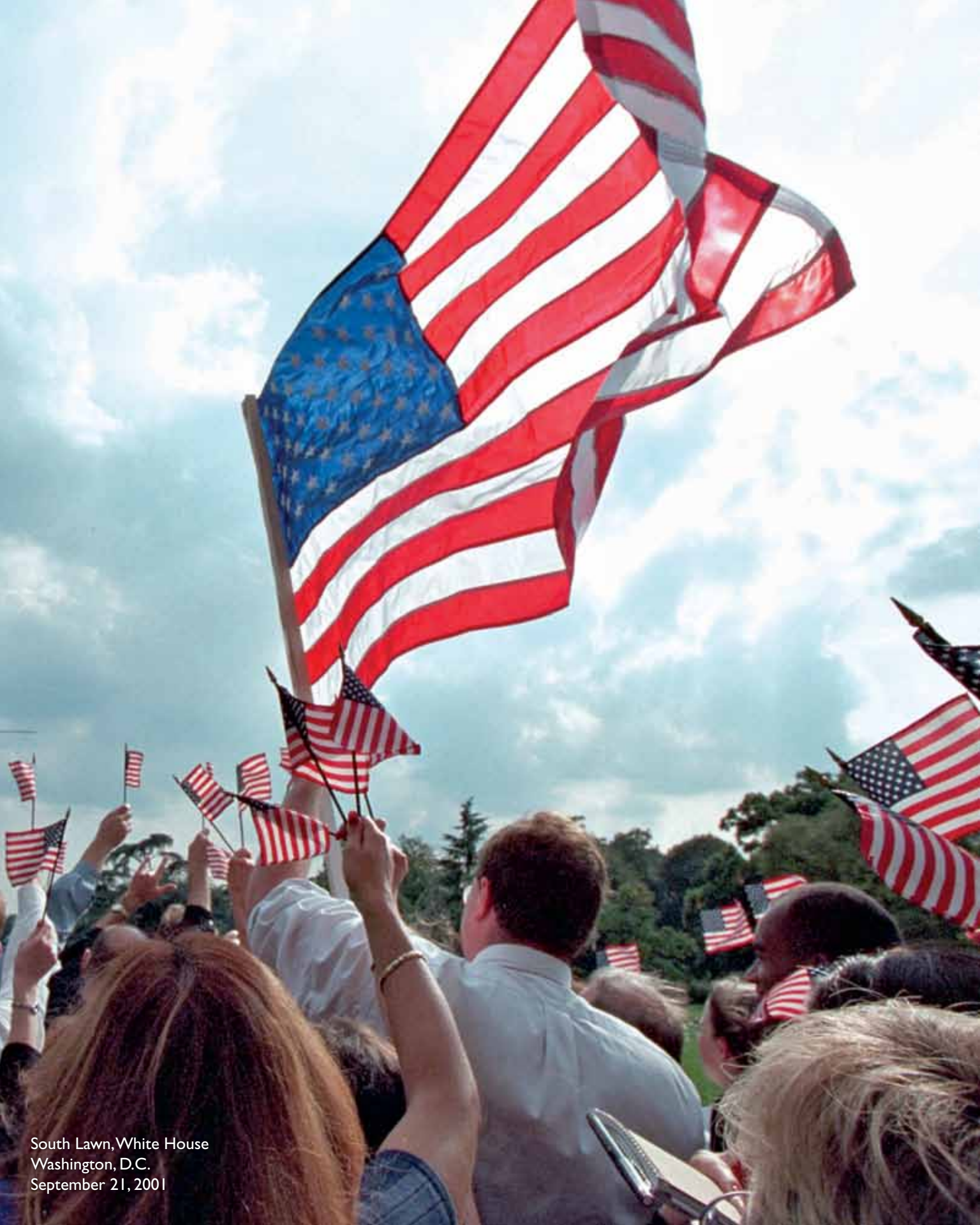
South Lawn, White House Washington, D.C. September 21, 2001