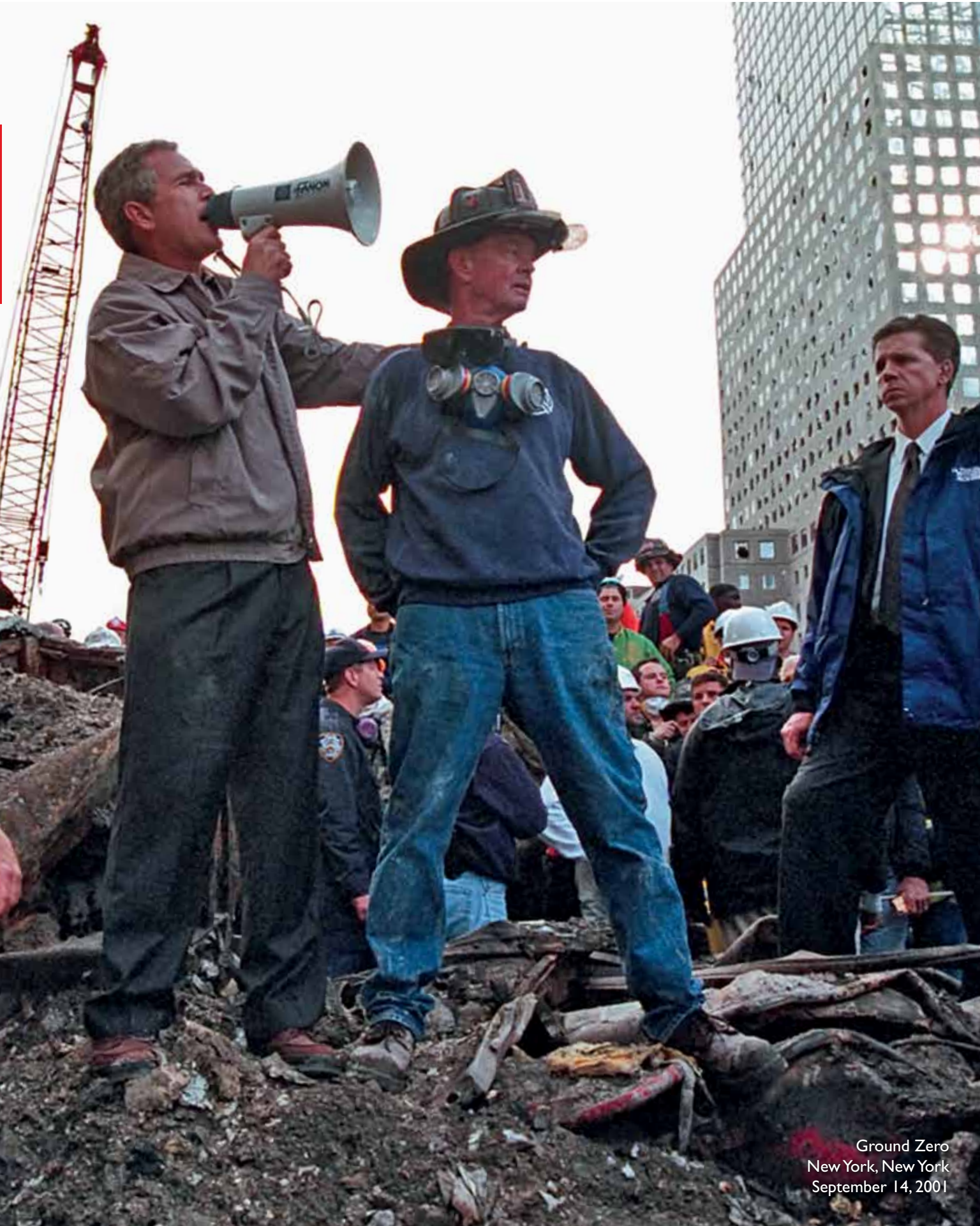
Ground Zero New York, New York September 14, 2001